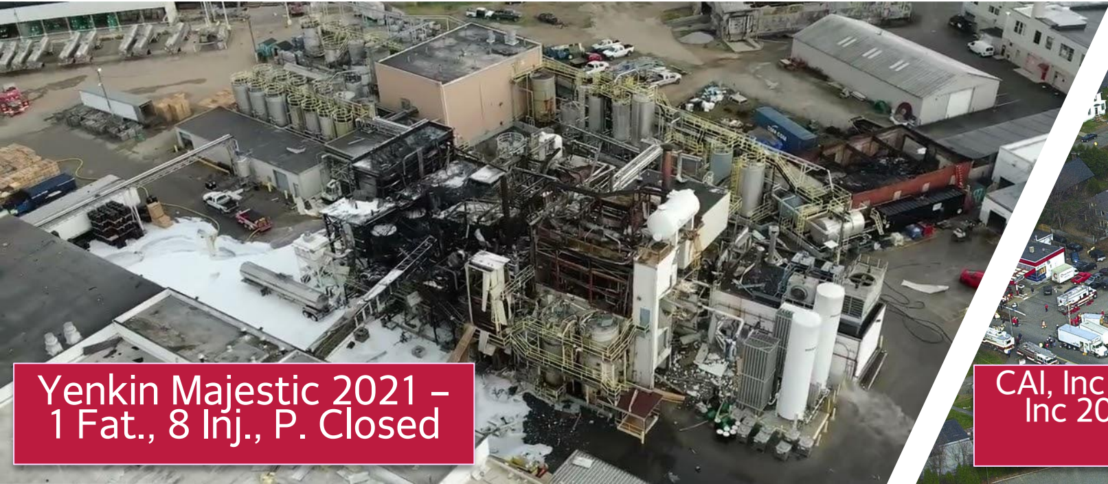
Yenkin Majestic 2021 - 1 Fat., 8 Inj., P. Closed