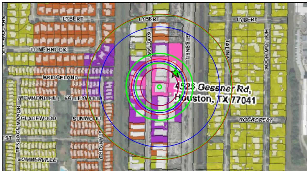
Watson Grinding, 2020