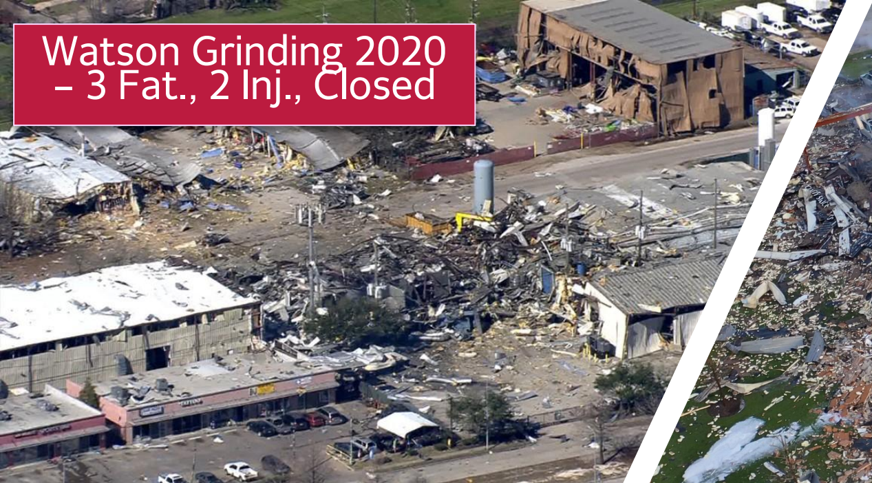
Watson Grinding 2020 - 3 Fat., 2 Inj., Closed