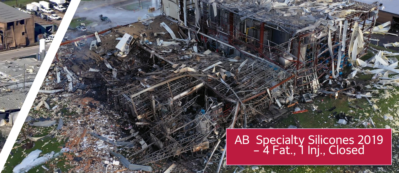
AB Specialty Silicones 2019 - 4 Fat., 1 Inj., Closed