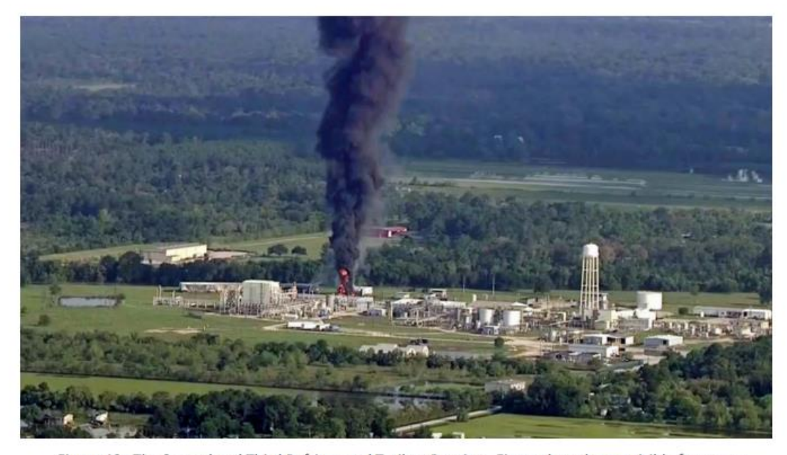
Figure 40. The Second and Third Refrigerated Trailers Burning. Fire and smoke are visible from two refrigerated trailers burning at the Arkema Crosby facility on September 1, 2017 [40].

[1] Organic Peroxide Decomposition, Release, and Fire at Arkema Crosby Following Hurricane Harvey Flooding Crosby, Texas Incident Date: August 31, 2017