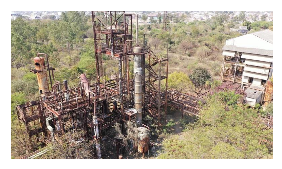
Bhopal, India, MIC Plant